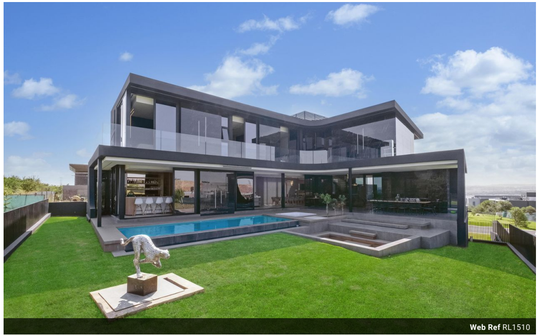
Web Ref RL1510